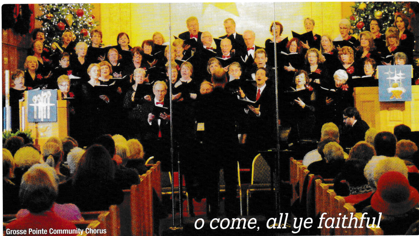
Grosse Pointe Community Chorus